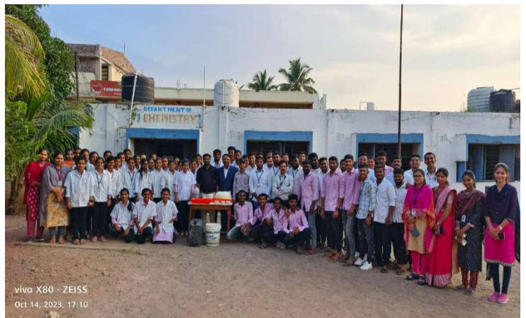
Students Participated in Preparation of Household Chemicals